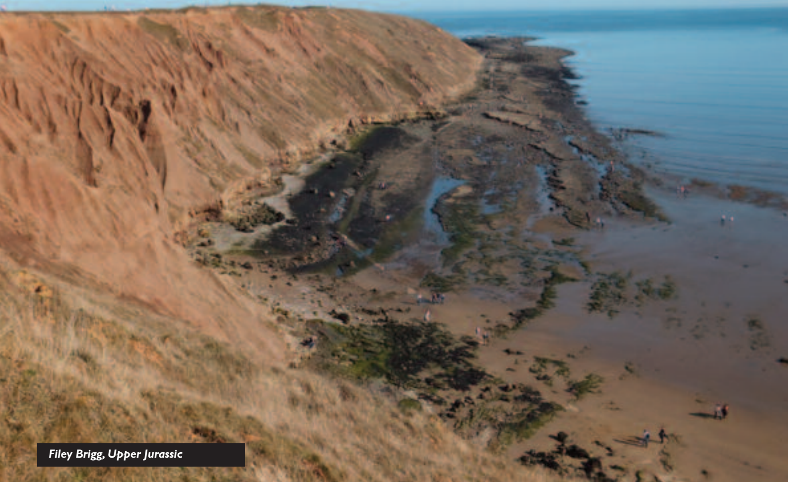
Filey Brigg, Upper Jurassic