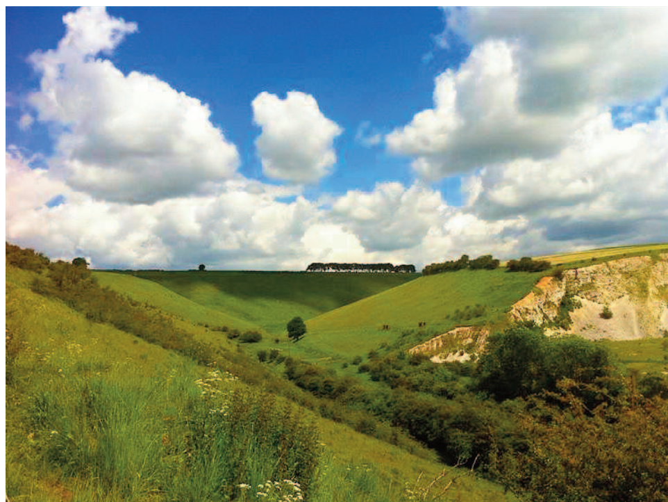
The Yorkshire Wolds

Please also see information contained in our 'Residential Field Trips 2021/2'