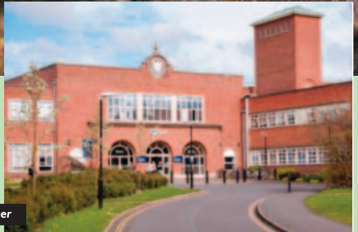
St John's Campus, University of Worcester