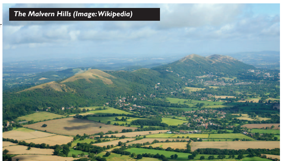
The Malvern Hills

Upon receipt, all monies paid for these trips are placed in a specific 'client trust account' where it cannot be drawn by us until after completion of the tour. This is in accordance with EU Directives and ensures that your money is safe in the unlikely event of corporate failure by Geo Supplies.