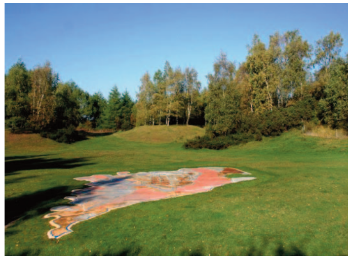
Geomap, Forest of Dean, Gloucestershire