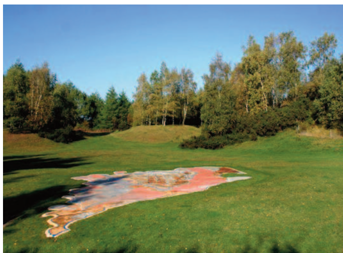
Geomap, Forest of Dean, Gloucestershire

If you would like to join us for the week without accommodation, please see the final page of this brochure for details of our non-resident packages.