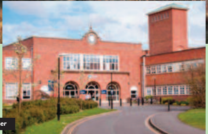
St John's Campus, University of Worcester