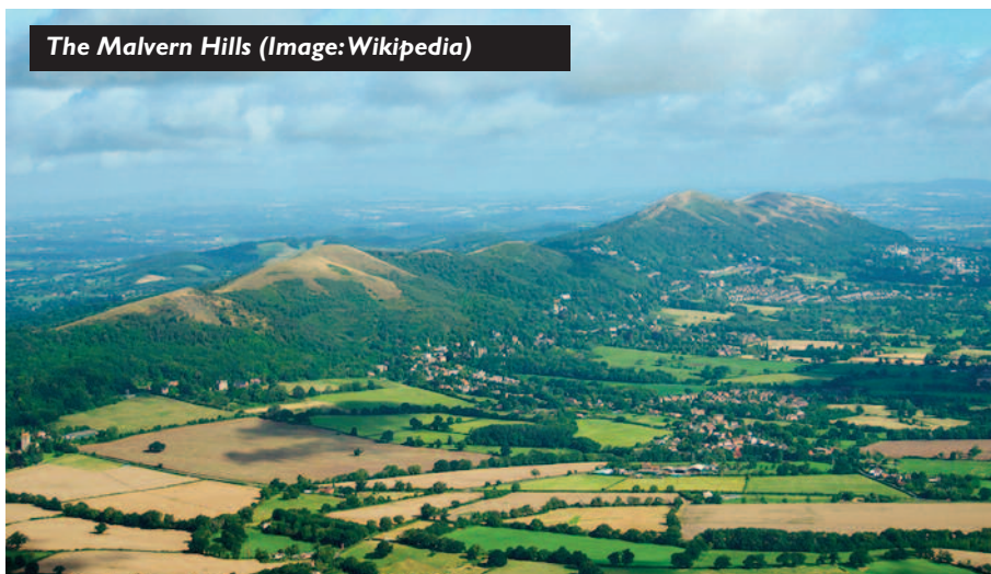
The Malvern Hills

Upon receipt, all monies paid for these trips are placed in a specific 'client trust account' where it cannot be drawn by us until after completion of the tour. This is in accordance with EU Directives and ensures that your money is safe in the unlikely event of corporate failure by Geo Supplies.