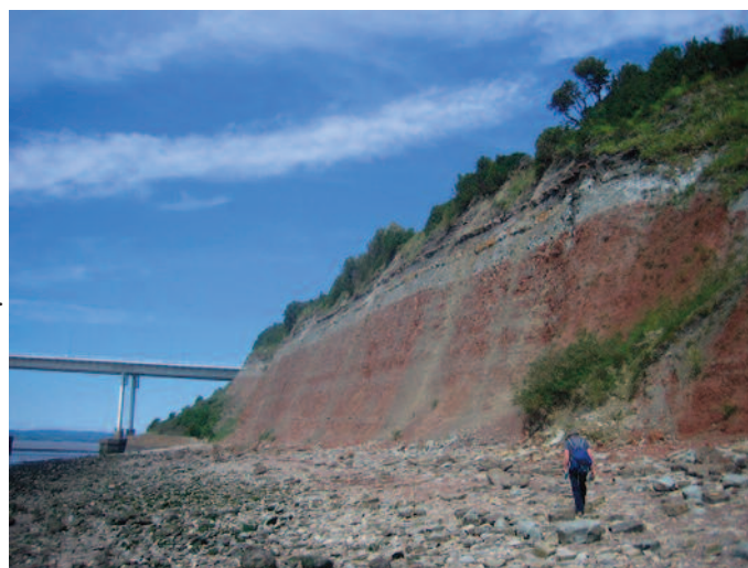
Aust Cliff, Gloucestershire

The last evening will feature a special summer school dinner with an after dinner speaker. We'll also hold one of famous quizzes one evening. With an on campus bar, there will be time to socialise and relax each evening, after we've completed our daily programme. We may also arrange an evening out in Worcester dependent upon your wishes.