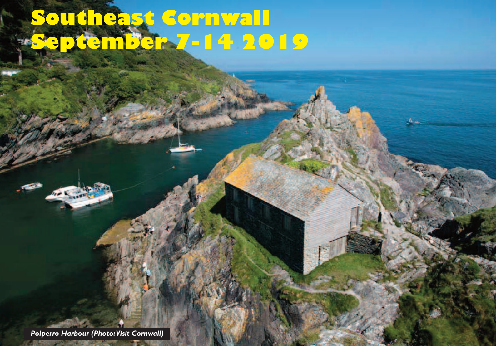
Polperro Harbour