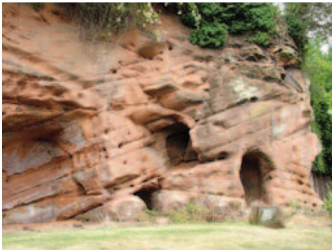
Permian sandstones at Bridgnorth, showing spectacular cross bedding.