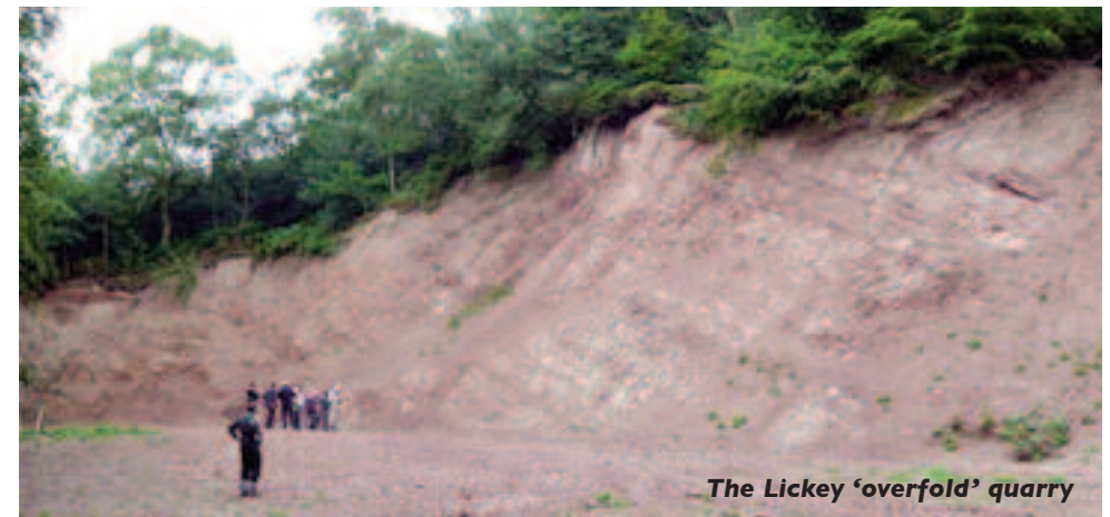
The Lickey 'overfold' quarry

For 2 people sharing a double or twin room, the cost of the 4-night tour will be £545.00 per person; for single occupancy, the cost will be £645.00 per person.